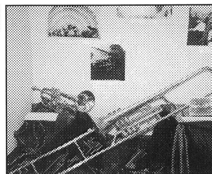
Display showing Benny Featherstone's cornet and the Ade Monsborough valve trombone, at the Archive