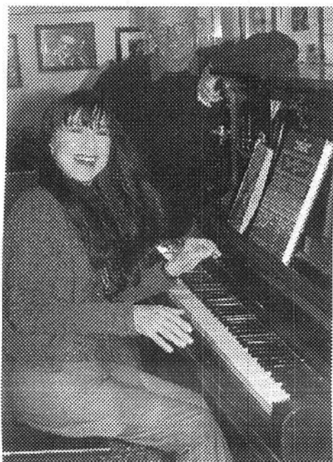
Judith Durham at the piano, after playing "Grace & Beauty Rag" to an appreciative audience including our Collection Manager.