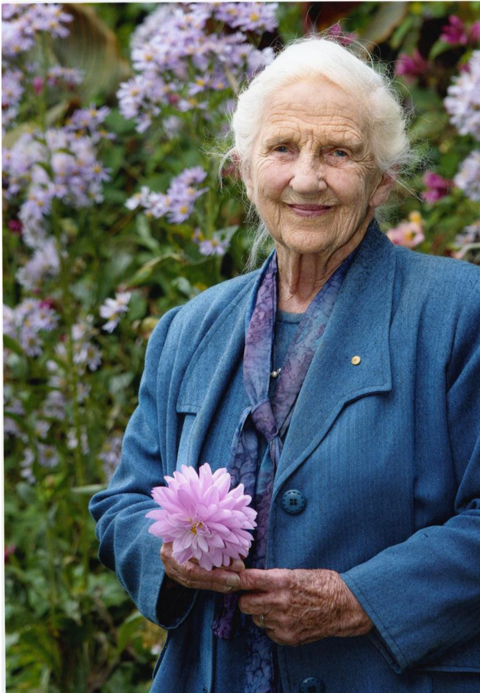
Dame Elisabeth Murdoch A.C. D.B.E.