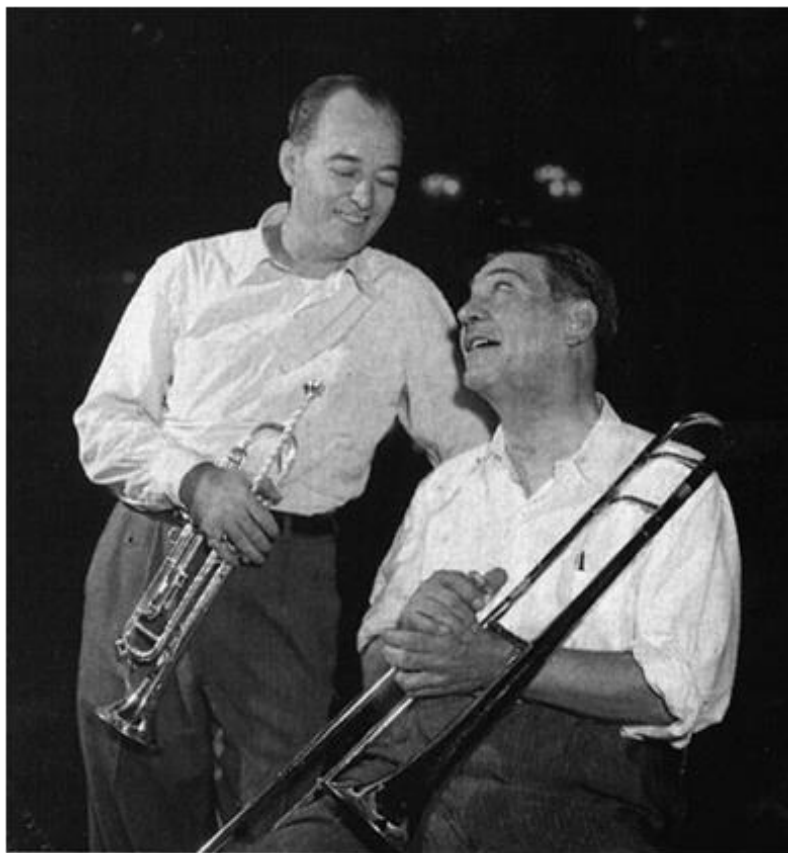
Two major white jazz influences: Bobby Hackett and Jack Teagarden

Still in New Orleans, Sudhalter raises the question of how much influence the large Sicilian population of that city had on the early development of Jazz. There were around 20,000 Italian migrants in New Orleans by the end of the nineteenth century, mainly Sicilians. The fear of the Mafia was everywhere. In October of 1890, a popular police officer was shot dead over the investigation of various factions. Nineteen Italians were rounded up but only nine were tried. In the public outrage, a crowd marched on the New Orleans prison and shot or clubbed to death eleven of the original nineteen arrested. The Sicilian population became a hated underclass, but nevertheless, a large number of Sicilian names rank greatly in the list of New Orleans jazzmen. Jazz aficionados will recognise the names of LaRocca, Roppolo, Almerico,